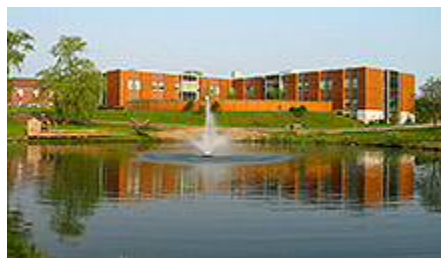
A view from the pond

The facility has their own Medical Director, Psychiatric Nurse Practitioner, Registered Nurses, LPNs, LMNAs, LNAs, pharmacists, dietitians, therapeutic recreation, and social work staff. A dentist makes scheduled visits to the Home, and services for mental health, as well as occupational and speech therapy, are contracted out. They also have their own bank, store, library, chapel, and recreation areas for residents, as well as the following departments: Resident Care Services, Admissions, Staff Development, Rehabilitation, Human Resources, Building & Grounds, Housekeeping, Laundry, Food Service, Medical Services & Supplies, Information Technology, Payroll, Spiritual Care, Public Affairs, Volunteers, Scheduling, Safety & Security, and Business. The many volunteers contribute enormously to enhancing the quality of life of our residents.