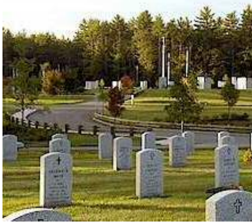
State Veterans Cemetery

The cemetery grounds, vestibule of the Administration Building and restrooms are open to the public seven days a week during daylight hours. The vestibule of the Administration Building has a grave locator, cemetery applications and other pertinent information. The Administrative offices are open Monday-Friday, 8:00am - 4:00pm, except for state holidays. Interments are not scheduled on weekends or state holidays.